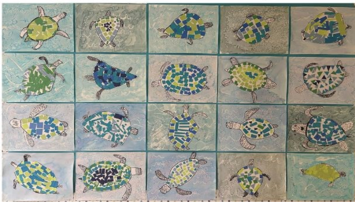
3rd Grade Texture Turtles