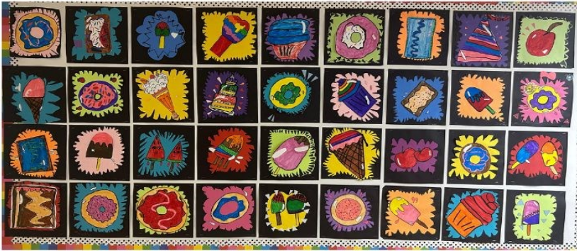
5th Grade Burton Morris Pop Art

The past several weeks we've been focusing on texture and different ways to incorporate it into our artwork. Students created dot art, mosaic sea turtles, patterned lions, hairy bears, pop art sweets and treats, and shoes designed from candy packages. Please enjoy some of the artwork below!