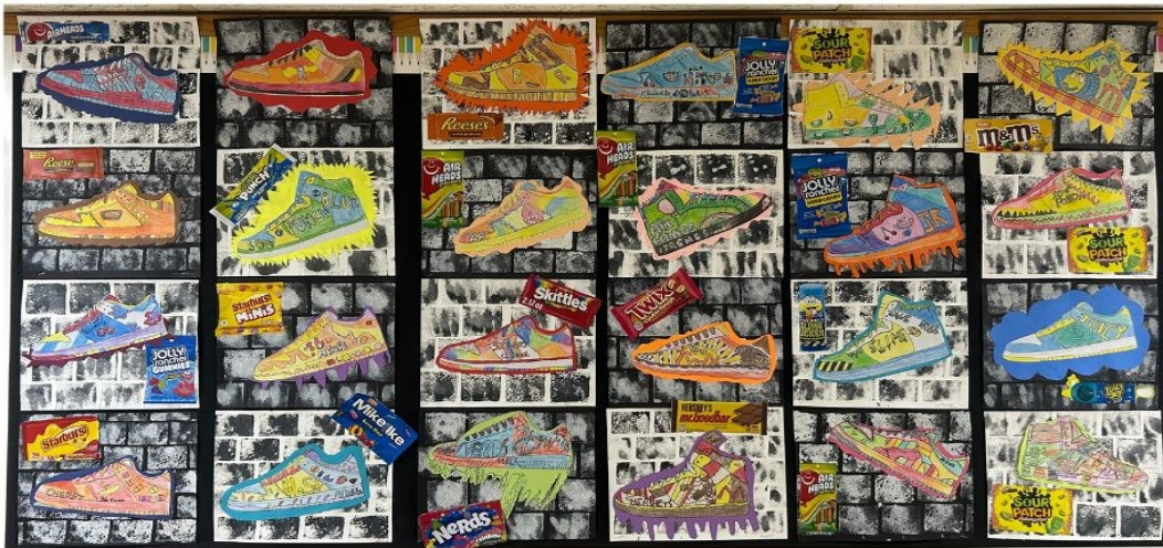
6th Grade candy inspired shoe designs