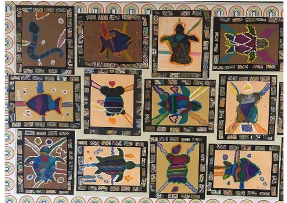
2nd Grade Aboriginal Dot Art