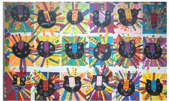
1st Grade Texture Lions