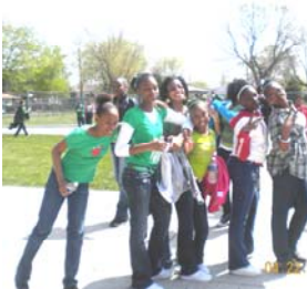
Students as they work on the Earth Day Project

I know it seems so close to the end of the school year and you may feel like it's already over, but this is the final push to retain as much information for 6 th grade. In language arts we are completing our books of poetry. During the school year we learned about different types of poems and thought.....LET'S MAKE OUR OWN!!! This has turned out to be a very positive experience.